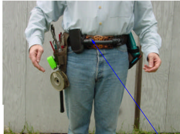
Arm and screen tuck out of the way for climbing etc.

lightweight, strong, self-cooling and tensioning, easily adapts. Configurable and will “dock”.